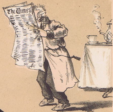
HIS GREAT SPEECH ON THE IRISH QUESTION.